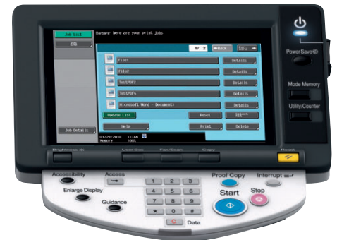
ineo panel with Personal Print

Personal Print, a small application for secure and efficient document output management, makes pull printing possible from a Windows environment. In other words, you get your jobs printed on any Personal Print-enabled system – at your convenience. This flexibility gives you the functionality of a personal printer while profiting from the cost-efficient page prices of shared multifunctional systems.